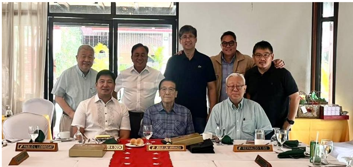
Photo taken during the FPI Legislation and Policy Committee meeting that was held on Thursday, December 11, 2025, 9:00am at the Pavillion & Cabana, Club Filipino, Eisenhower Street, Greenhills, San Juan City.