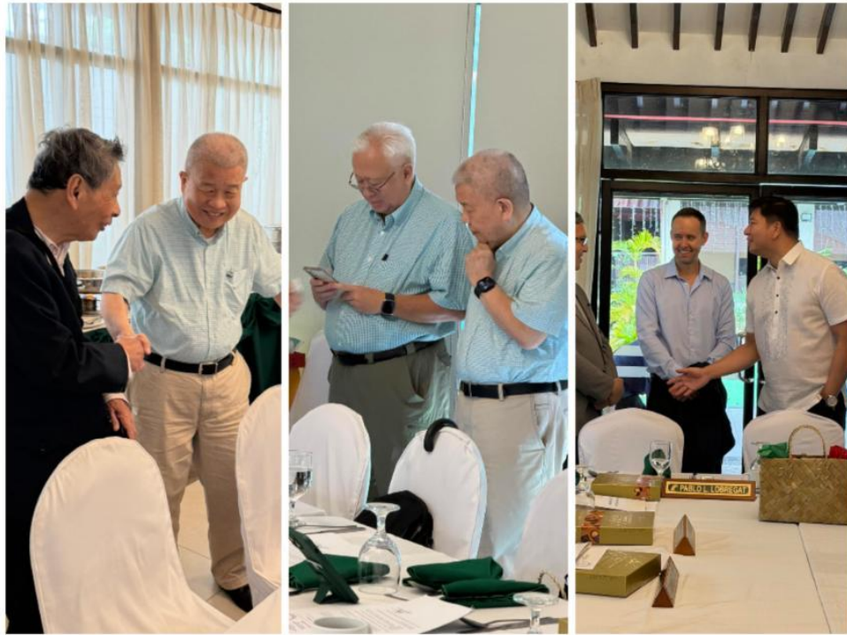
Photos taken during the FPI Board meeting held on Thursday, December 11, 2025, 11:00am to 3:00pm at the Pavillion & Cabana, Club Filipino, Eisenhower Street, Greenhills, San Juan City.