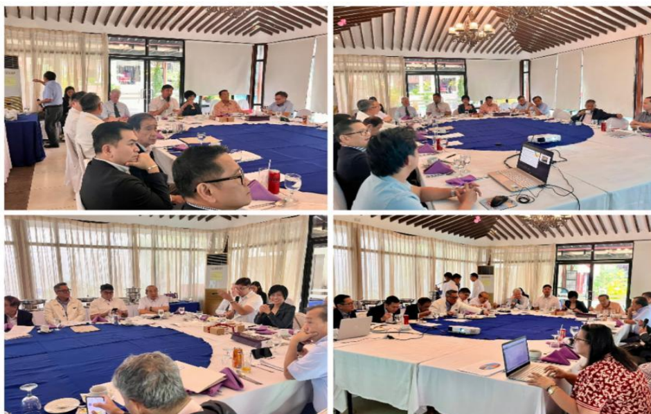
Photos were taken during the FPI Board Meeting on January 14, 2026, Wednesday, 11:30am, Pavillion & Cabana, Club Filipino, San Juan City.