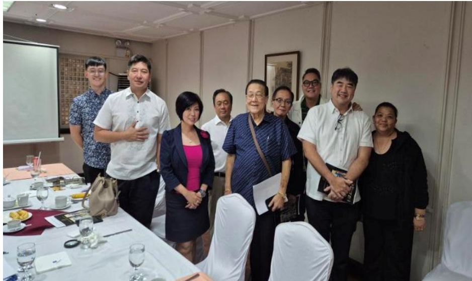
Photo was taken during the FPI Summit/Events Committee Meeting on January 21, 2026, Wednesday, 10:00 am Jasmin Room, Club Filipino, San Juan City.