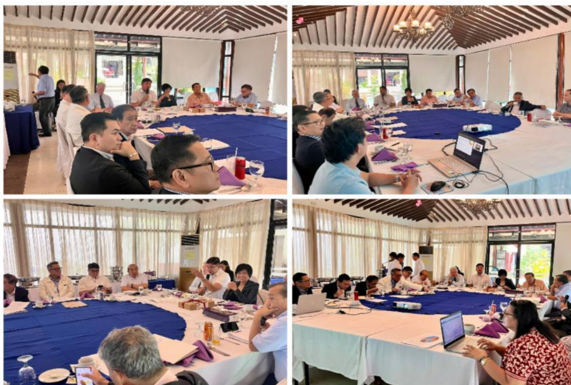
Photos were taken during the FPI Board Meeting on January 14, 2026, Wednesday, 11:30am, Pavillion & Cabana, Club Filipino, San Juan City.