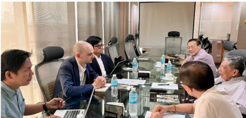
Photos were taken during the FPI-Lead-Acid Battery Recycling Initiative (LABRI) Meeting held on Monday, 26 January 2026, 2PM at the FPI Boardroom.