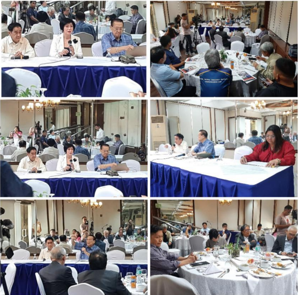
Photos were taken during the FPI press conference on Friday, 24 April 2026, 11AM, Centennial Rm., Club Filipino, Greenhills, San Juan City. The press conference focused on the Federation's appeal to the Supreme Court to stop lower courts from issuing TROs vs product standards.