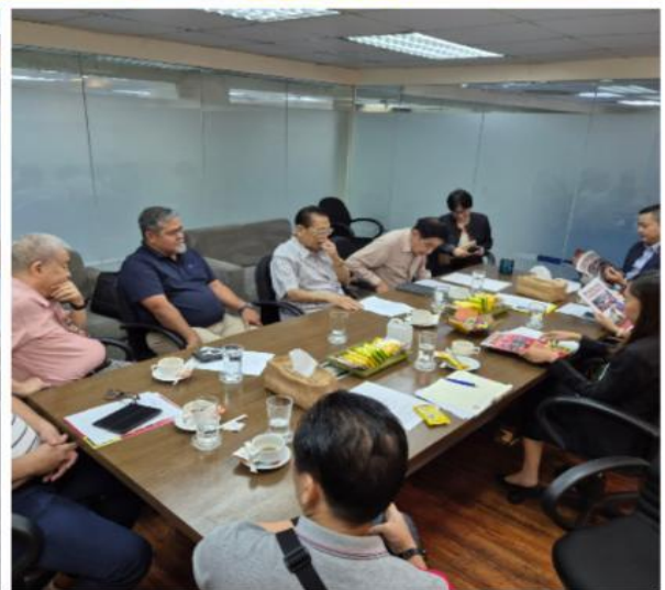
Photos were taken during the FPI-DTI Meeting on Monday, 20 April 2026, DTI Makati City.